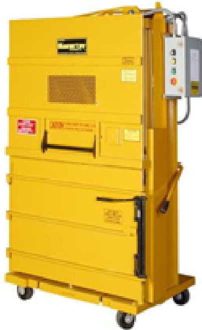
TCG-M42BC Stock Room Cardboard Baler

Is Pleased To Provide The Following Stock Room Cardboard Baler Proposal FOR Companies Located North America 2008